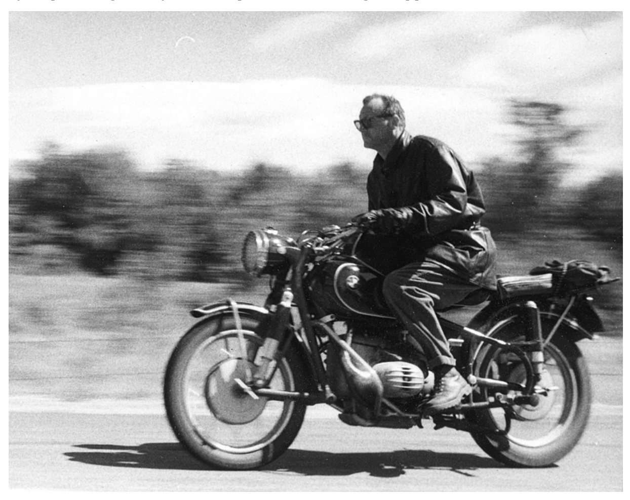
C. W. Mills

2016 marks Charles Wright Mills' 100<sup>th</sup> birthday. Mills (1916-1962) was a key figure for critical sociology. According to an ISA survey, C. Wright Mills's 'The Sociological Imagination' (1959) still ranks second among the most influential books in sociology ever published. Mills called for 'imagining' how individual lives are interconnected with public issues. For transforming sociology into a potentially liberating force, he offered a trenchant critique of sociology's 'grand theory' and 'abstracted empiricism' at the time by emphasizing history as a vital part of the sociological approach.