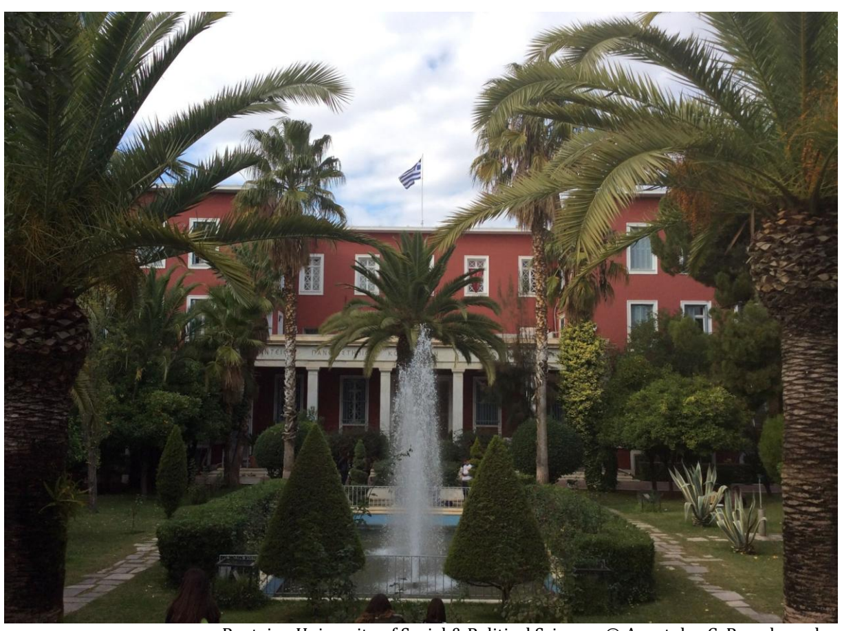
Panteion University of Social & Political Sciences