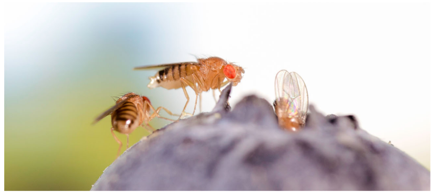
Fig. 1 Fruit fly D. melanogaster female with exposed ovipositor on blueberry

A range of mammalian Ors is responsive to aldehydes (e.g. Benbernou et al. 2007; Saito et al. 2009; Nara et al. 2011), including human Or1a1 and Or2w1 (Geithe et al. 2017a,b). Z4-11Al is produced in the anal gland of male wild rabbits and may be involved in territorial marking; the aldehyde was found to affect the heart rate when perceived by other male rabbits (Goodrich et al. 1978). The positional isomer ( E )-2-undecenal is a bovid body odor (Gikonyo et al. 2002) and olfactory sensory neurons of ticks tuned to aldehydes afford indirect evidence for aldehydes as vertebrate signals (Steullet and Guerin 1994). A characteristic scent which is reminiscent of tangerine emanates from colonies of crested auklet, a monogamous seabird. Two